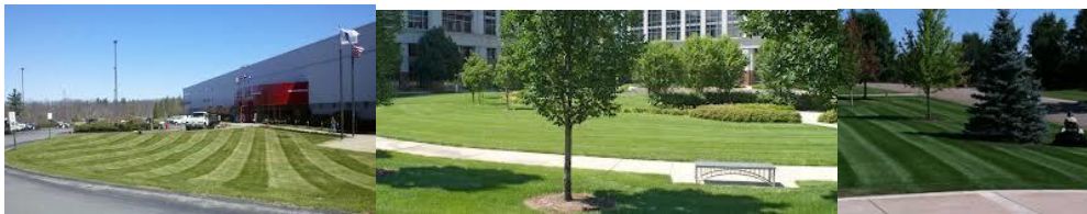
Cutting, Cleaning, Edging...